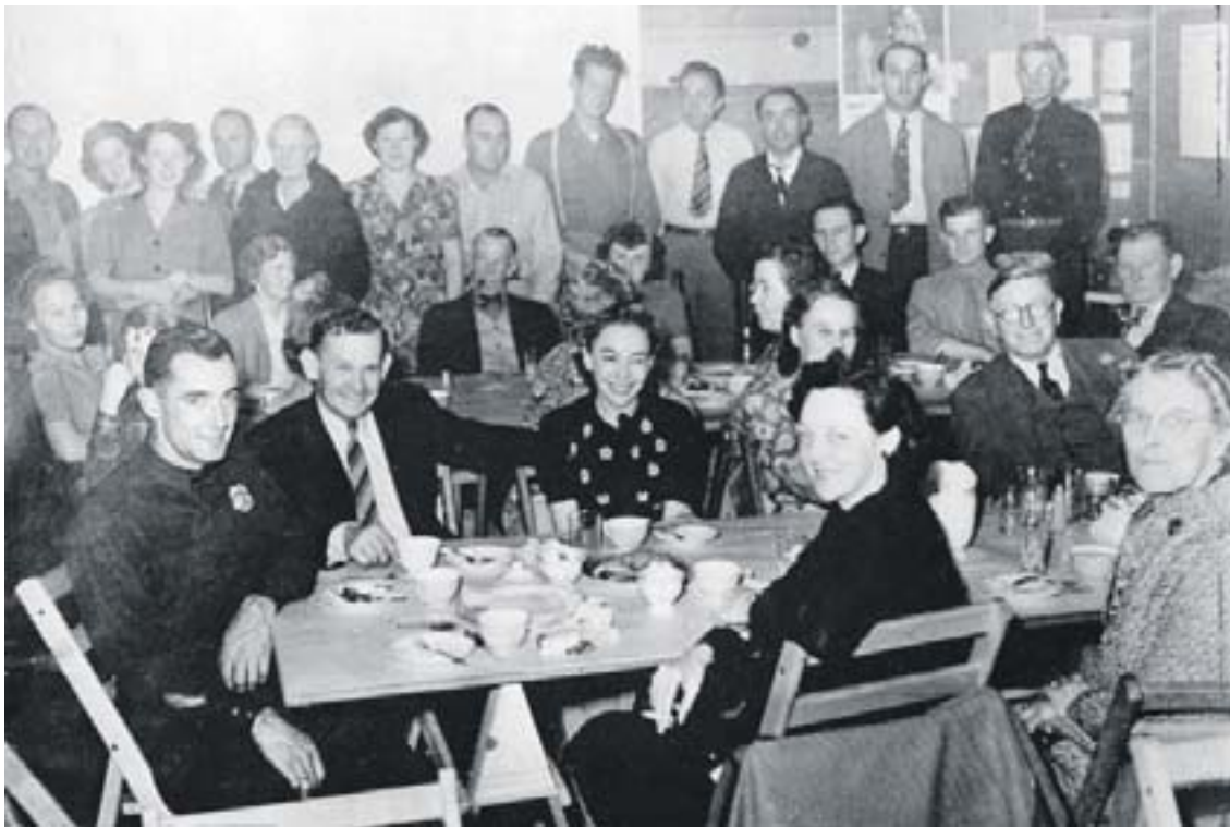
The Lafayette Historical Society is hoping to obtain oral histories from longtime Lafayette residents who may have been involved in things like this 1931 annual dinner of the volunteer fire department in Lafayette.